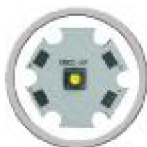
LED light source(CREE)