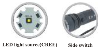
LED light source(CREE)